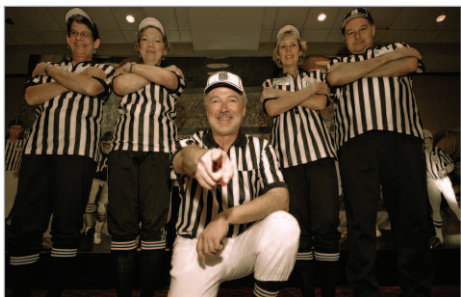
Referee Team RTA!