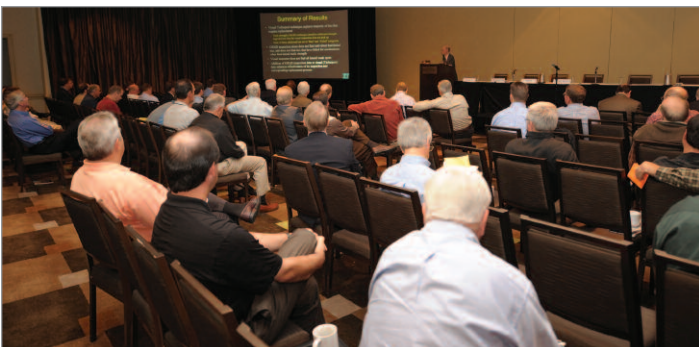
Attendees listen intently during the Thursday morning sessions.