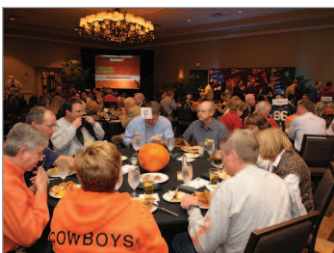
Team spirit everywhere!