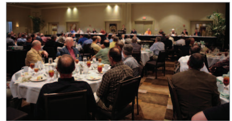
The RTA Thursday Business Luncheon was well attended.