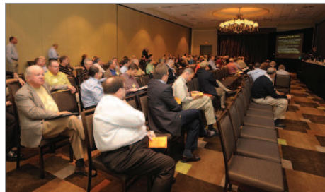
Attendees during a business session.