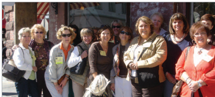
RTA ladies posing as they wait to go into Paul Deen's Lady & Sons Restaurant.