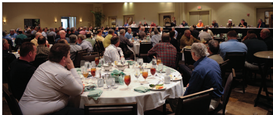
Business Luncheon crowd.