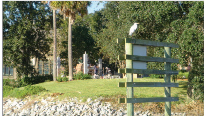
One of Savannah's "residents."