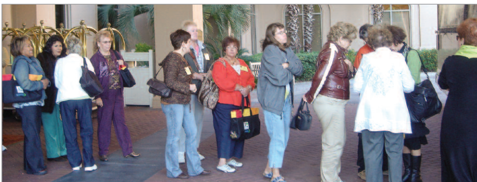
Ladies brave the cold to climb aboard the Savannah trolley.