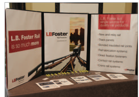
L.B. Foster Co.