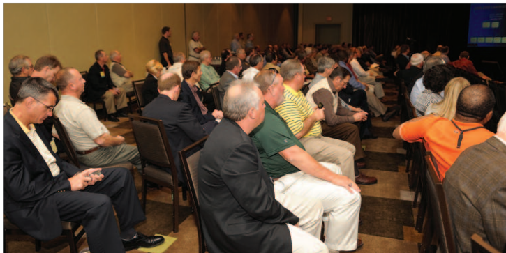
Attendees during Thursday afternoon sessions.