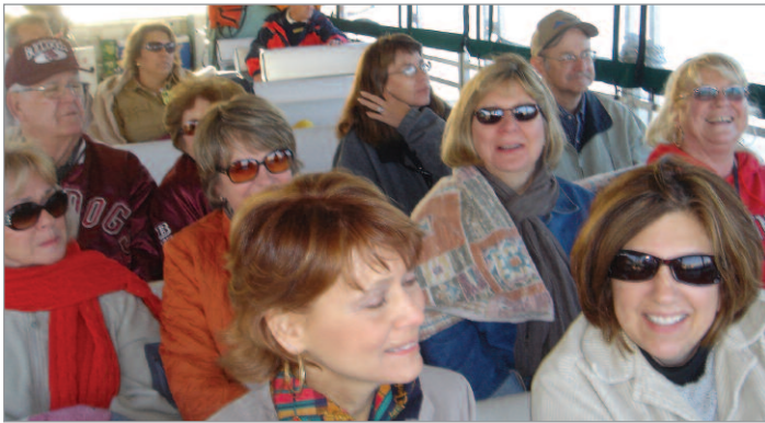
RTA members and guests brave the cold to do a little sightseeing—pontoon style!