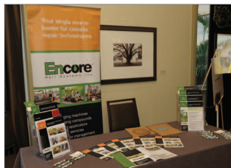
Encore Rail Systems, Inc.