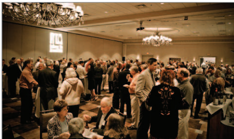
Record numbers gather in Savannah.