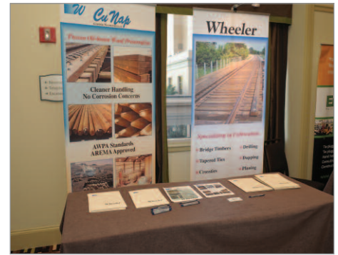
Wheeler Lumber, LLC.