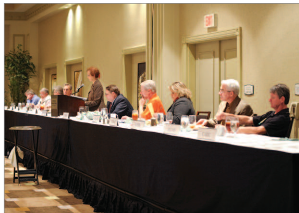
Head table during the Annual Business Luncheon.